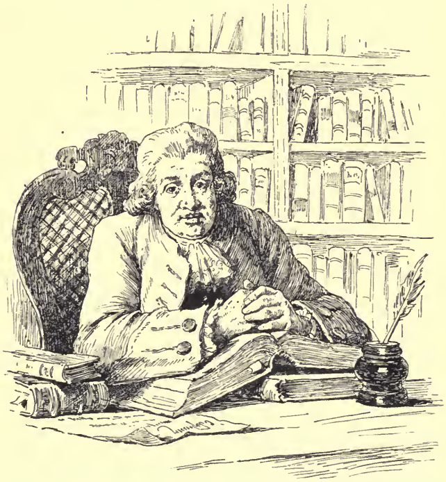
‘ Dr. Cambray. ’

‘There is something more now, Harry Ormond, I know by